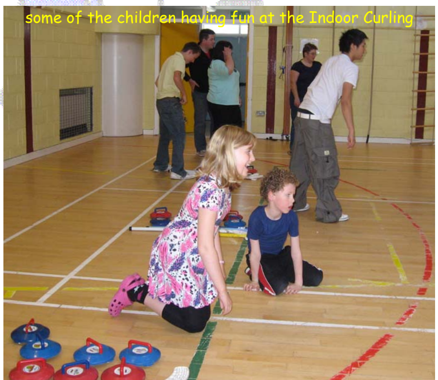
some of the children having fun at the Indoor Curling