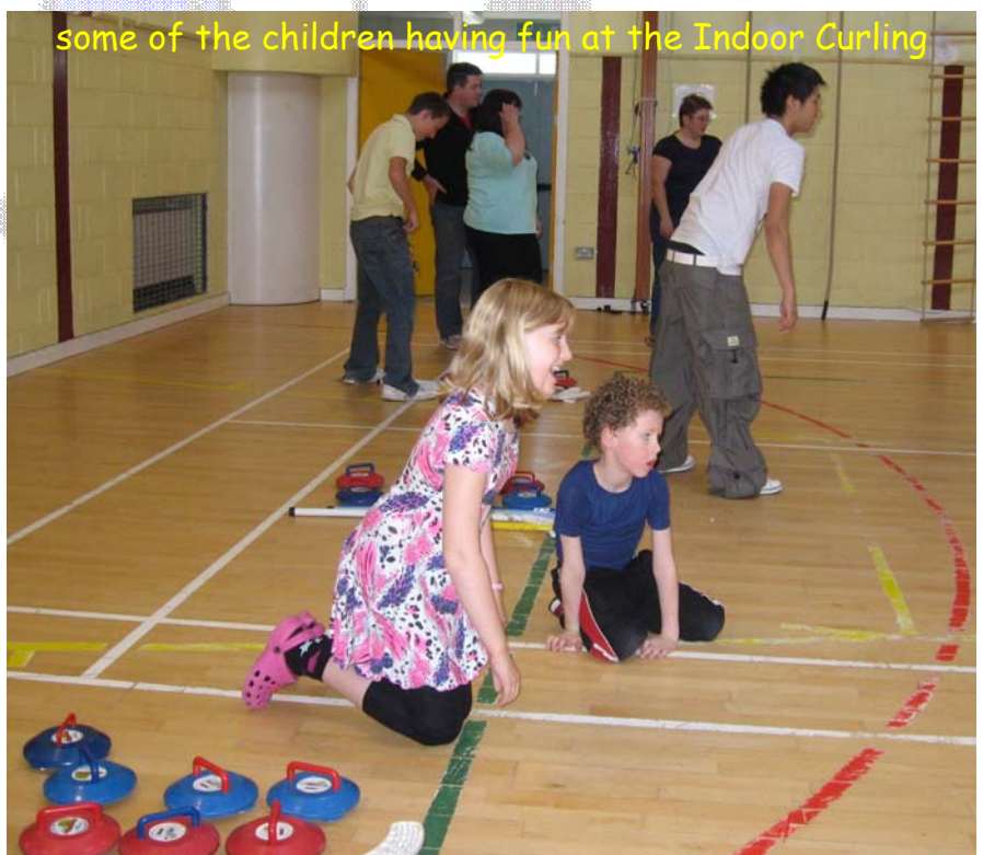
some of the children having fun at the Indoor Curling