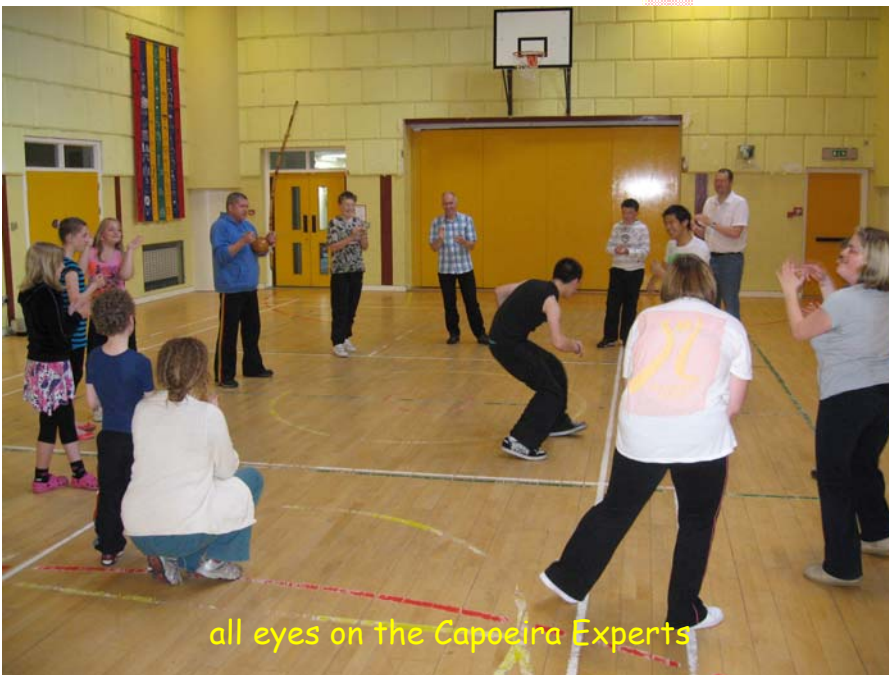
all eyes on the Capoeira Experts

On September 27 th HD CD held a Family Fun Day at Strathpeffer Community Centre which was well attended by some familiar faces but it was also welcoming and encouraging to meet many new members.